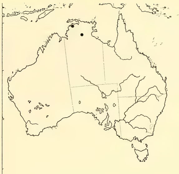
Fig. 3. Clivina demarzi spec. nov., distribution.

impressed, distinctly punctate to about last third. Intervals convex, especially at base and at apex, in holotype strongly convex throughout. A short scutellar stria present within 1st interval. Odd intervals near apex wider and more elevated than even intervals. 7th interval carinate, 8th interval extremely narrow near apex. In holotype three internal striae free at base, 4th stria meeting 5th; in paratype also 4th stria free. No subhumeral carina recognizable. Punctures on 3rd stria foveate. Structure of lateral channel slightly catenulate, because punctures are somewhat tuberculate. Microsculpture on elytra isodiametric, more distinct than on head and pronotum. Metasternum between intermediate and posterior leg shorter than metacoxa, in paratype much shorter. Metepisternum slightly (holotype) or considerably (paratype) wider than long, in paratype posteriorly rather wide. Last abdominal sternum 4-setose in both sexes. Posterior wings reduced to a small membrane. Elytra tightly fused together.